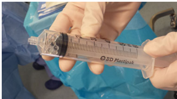
Fig. 1 Sterile Luer–Lock syringe with microspheres.

Fat was harvested from the abdomen using a 2-mm multi-port small-hole cannula and was sheared into finer particles using 60 mL sterile syringe Luer–Lock with microspheres (→Fig. 1). After 7 to 10 minutes of infiltration of the donor site with Klein solution (→Fig. 2), 20 mL of fat was harvested from the abdomen (→Figs. 3 and 4), and after decantation and separation of the liquid component, 6 ml was injected into each knee (→Fig. 5) under local anesthesia. Decanted fat was injected percutaneously with 1-mm cannulas. Percutaneous access to the knee articular space was located at the superior-lateral margin of the patella. Patients were asked to avoid sports activities for 7 days after the treatment.