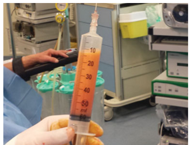
Fig. 4 Fat tissue into the syringe.

In the postoperative period, an abdominal girdle for 15 days was applied to all patients, to reduce the formation of a local hematoma, while a pressure dressing was applied to the knee for 1 day. All the patients followed a rehabilitation protocol to improve posture and muscle toning.