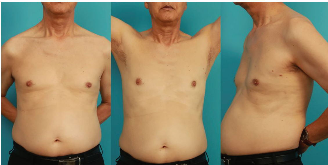
Fig. 2: (A) 72 year-old male who underwent subpectoral ICD insertion two months ago. (B, C) The short axillary incision scar is visible only when the patient's arms are held up, and even then only barely.

Of the 266 patients who underwent CIED implantation at Seoul St. Mary's Hospital, the subpectoral implantation was performed in 32 (12%) patients, whereas 234 (88%) patients underwent conventional prepectoral implantation. Of the 32 patients who underwent subpectoral approach, new implantations of CIED were in 24 of 32 patients (Figure 2) and 8