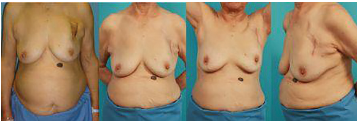
Fig. 5: A 79 year-old female patient who underwent conventional prepectoral implantation. (A) The skin overlying the device had become very thin and showed infection signs. (B, C, D) After pocket change to the subpectoral pocket and excision of necrotic skin, the patient no longer could palpate the device, and risk of device protrusion was minimized.

prepectoral pockets that medically require or electively choose to receive this procedure. The use of CIED has sharply increased because recent technical advances have enhanced functional aspects and expanded treatment indications. 7-9 The conventional prepectoral implantation technique has been widely used because it is easily and quickly performed without the need of surgical collaboration requiring less demanding surgical skills. 10