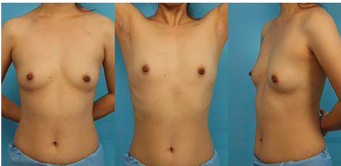
Fig. 3: A 35 year-old female patient who underwent a subpectoral implantation 11 months ago with an additional subclavian venous approach. (A) The subclavian scar is visible upon anterior view. There is no asymmetry of the breasts. (B, C) The axillary incision is barely discernible even when the patient lifts her arms up.