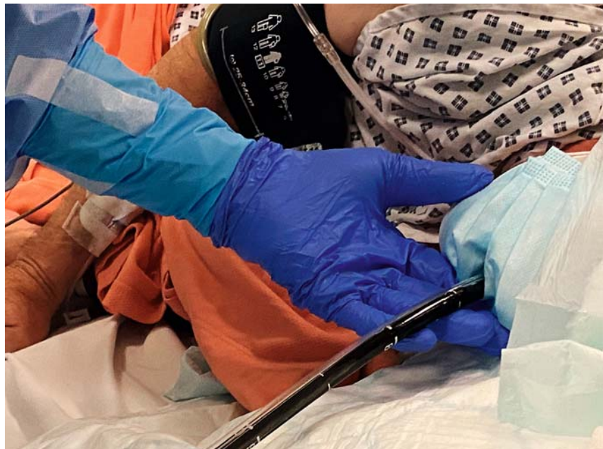
► Fig. 2 The “double surgical mask with slit” being used in clinical practice during antero-grade double-balloon enteroscopy.