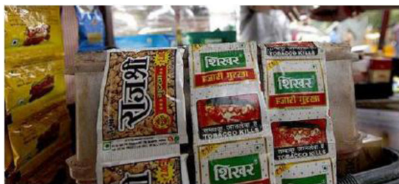
Fig. 3 Example of smokeless tobacco packaging in India f4:2 (December 2011 – April 2016)

The results from this study highlight the critical need to improve the salience and other downstream effects of HWLs on SLT products. To date, the progress of India's HWLs on both smoked and SLT has reflected a tangled exchange between the tobacco industry and the Indian government [22]. Research evidence on whether the effectiveness of warnings—on both smokeless and smoked tobacco products—will continue to be an important component of efforts to increase the impact of policies in this domain. Notably however, India's government has implemented new mandated warnings that are among the strongest in the world (as of April 1, 2016). These new labels now cover 85% of the front and back of the principal surfaces of the packaging [44]. The industry however has attempted to fight back by halting tobacco production. The industry is claiming that they paused manufacturing because of confusion over the new HWL requirements, but antismoking activities claim that this was in fact an attempt to put pressure on regulators through means of economic impact (e.g., through losses in employment of factory workers and farmers and tax revenues) [45].