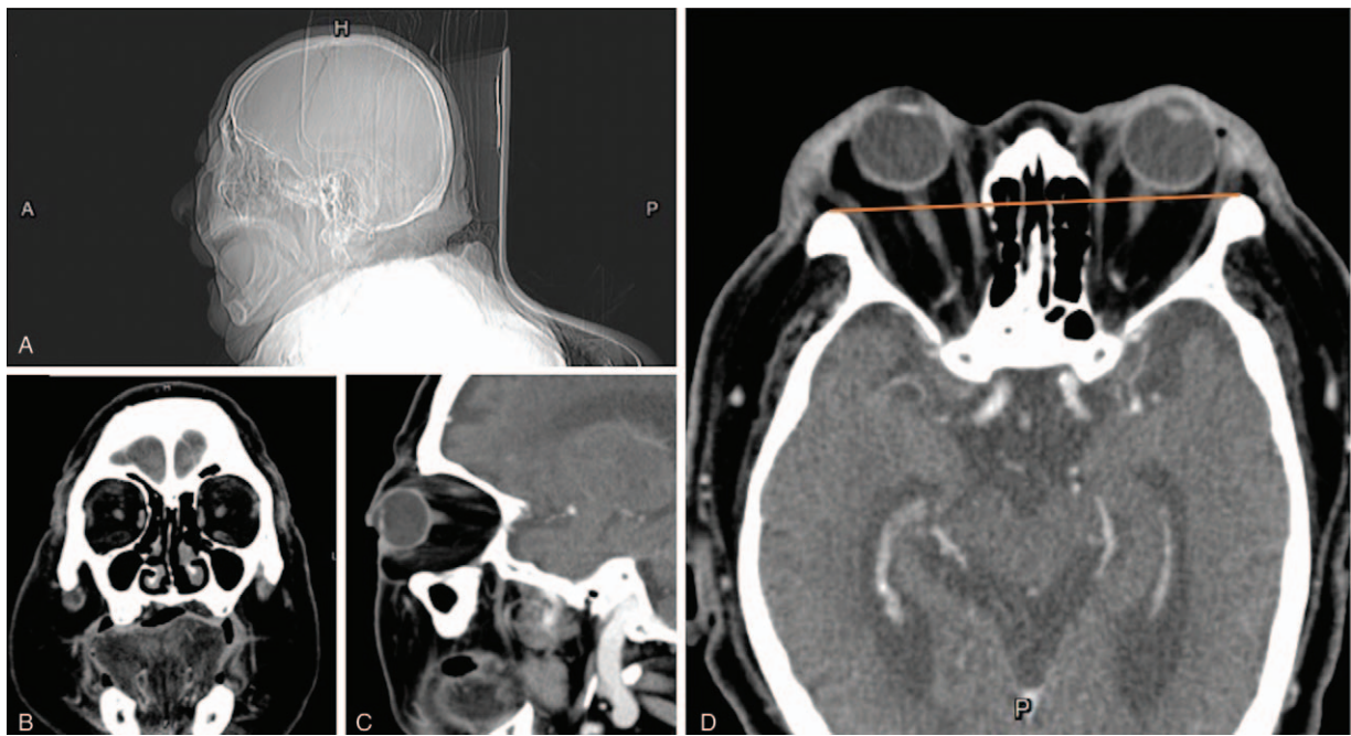
Figure 2. Orbital CT revealed significant massive deposits of lipomas located symmetrically around the orbit and neck region (A–D). The x-ray scan also showed buffy upper trunk figure (A). Coronal view (B) showed obvious subcutaneous fat and macrogloria. Sagittal view (C) showed prominent intra and extra-orbital fat causing the large bagging. Transverse view (D) also revealed significant intraconal fat causing a grade 3 proptosis and stretching of the optic nerve. The orange line is the interzygomatic line.

A classification proposed in 1991 based on the fat distribution pattern separated the diseases into 4 types: type I BSL (Madelung’s “fat neck”) affects the neck and submental region; type II BSL (pseudoathletic type) is localized at the shoulder girdle, upper arms and trunk; type III (gynecoid type) involves the