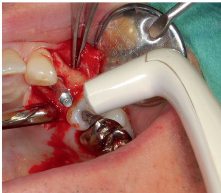
FIGURE 2: RFA measurement of an implant utilising a SmartPeg™ transducer and an Osstell Mentor™ machine (Osstell AB, Gothenburg, Sweden).