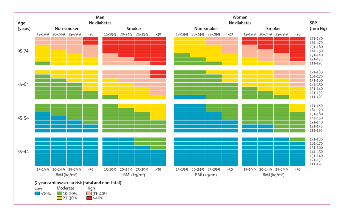
Figure 1. Risk scoring chart

How to use the chart: (1) choose the section with the patient's sex, diabetes, and smoking status; (2) find the cell that matches the patient's risk factor profile using age, BMI, and blood pressure; (3) refer to physician those with excessive blood pressure (>180 mm Hg).