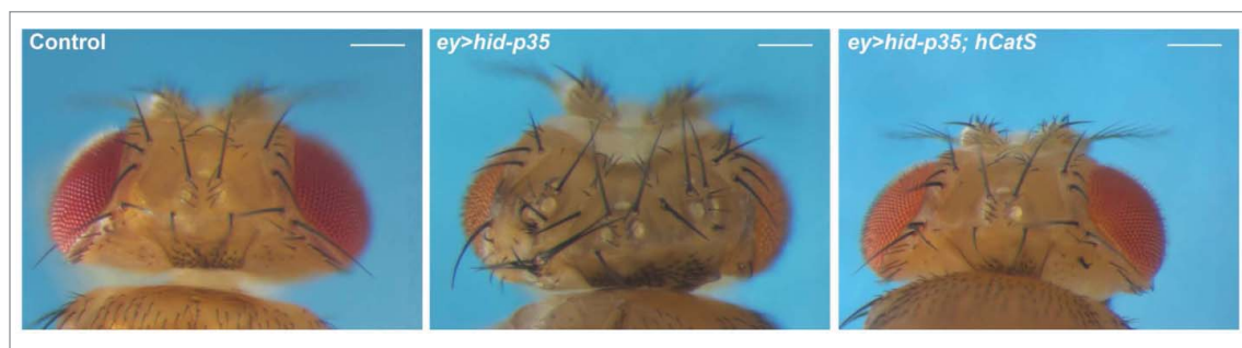
Figure 2. Undead tissue displays eROS-dependent hyperplastic overgrowth. Co-expression of hid and p35 in the developing eye imaginal disc using eyeless-Gal4 ( ey-Gal4 UAS-hid UAS-p35 ( ey>hid-p35 )) promotes hyperplastic overgrowth of head cuticle with pattern duplications compared to wild-type control (A, B). Simultaneous expression of an extracellular catalase ( hCatS ), which neutralizes H 2 O 2 , suppresses overgrowth and normalizes the pattern of the adult head (C). Scale bars, 200 μm.

Reactive oxygen species (ROS) are partially reduced metabolites of oxygen, which include superoxide