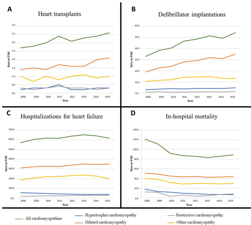
Figure 1. Temporal variations of inpatient prevalence of cardiomyopathy patients with at least one clinical event or procedure from 2008 to 2015: A. Heart transplants; B. Defibrillator implantations; C. Heart failure; D. In-hospital mortality. PMI: Per million inhabitants.