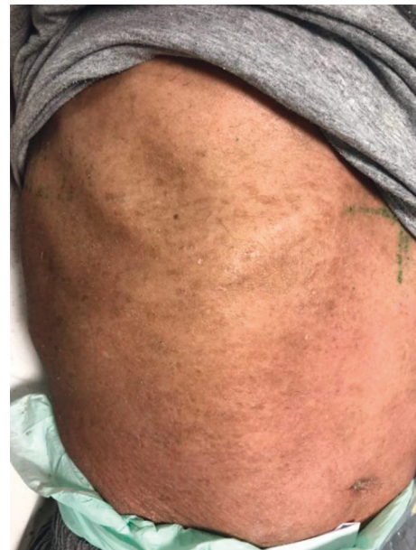
FIGURE 4: The abdominal image of the patient— after RT.

higher [5, 6]. In the literature, 20–30 Gy/10 frc or 8 Gy/1 frc treatments have been applied for palliative purposes. In advanced MF, the remission of symptoms has been reported in 36–96% of these treatments [6, 7]. Despite the promising