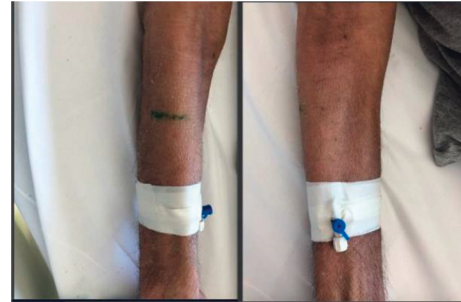
FIGURE 2: The right upper extremity image of the patient—after RT.

Radiotherapy has been used for many years for patients with MF. Radiotherapy is not only effective treatment for the early-stage disease but also contributes to palliative treatment when the disease is advanced. For advanced MF, TSEI is involved in palliation of symptoms such as itching, pain, or dandruff. To date, experiences have shown that the effective dose of RT in the curative treatment of MF is 30 Gy or