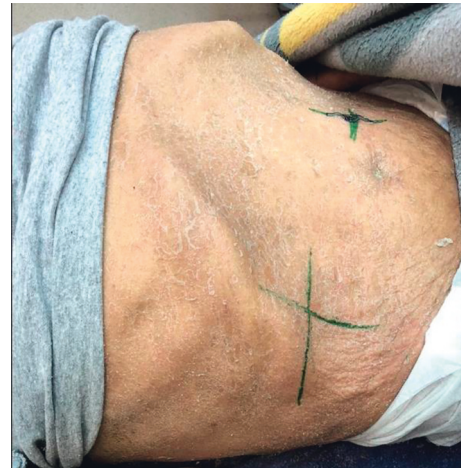
FIGURE 3: The abdominal image of the patient—before RT.