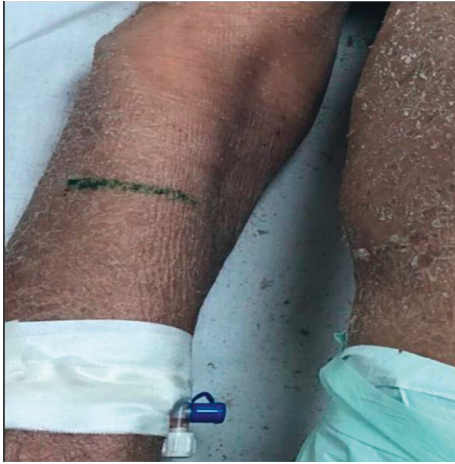
FIGURE 1: The right upper extremity image of the patient—before RT.

treatment, which was administered before RT, improved the patient's complaints of pruritus and hypothermia. The most complained areas of the patient were bilateral flexor and the upper anterior hemibody. RT was started on the flexor part of the bilateral arms with the most complaints. RT was applied with Elekta Versa HD device, SSD 100 cm, 6 MeV electron energy, 0 gantry angle, using a 20 \times 20 applicator. The fraction (frc) dose was 2 Gy, and a total dose of 6 Gy was given. Clinical relief was observed after the first treatment (Figure 2). Following the response, RT was planned for the upper anterior hemibody (Figure 3). Because of the large RT area, right and left dual center radiotherapy was applied. For the right upper anterior hemibody radiotherapy, a 3200 gantry angle of 6 MeV electron energy with an SSD of 100 cm was used. Also, for the left upper hemibody radiotherapy, a 25 \times 25 applicator at a 400 gantry angle with the same energy at SSD 100 cm was used. The 2 Gy was given per fraction, and the upper anterior hemibody received a total dose of 6 Gy. Significant clinical relief was observed with 6 Gy radiotherapy and medical treatment recommended by a dermatologist (Figure 4). The patient died due to multiorgan failure 2 months later, and no recurrence was observed in the RT areas.