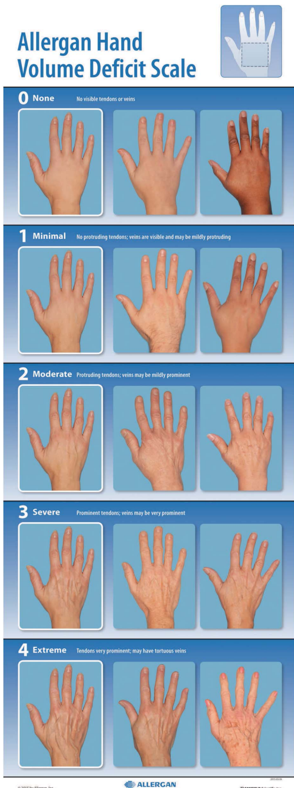
Figure 3. The Allergan Hand Volume Deficit Scale assigns a grade from none (0) to extreme (4) describing the degree of protrusion of tendons and veins in the dorsal surface of the hand.

images of each subject's right hand were collected at the first live validation session using a hand device and Nikon D90 SLR camera. The first 5 subjects rated during the first validation session were considered run-in training subjects and were excluded from the analysis.