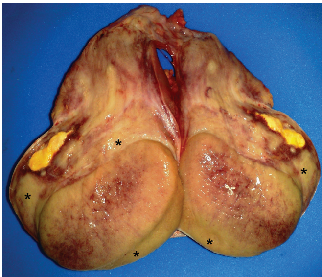
Figure 1 - Testicle without fixation, extensively infiltrated by cream-colored neoplasia (*) and with areas of necrosis

Anatomopathological and immunohistochemical analyses of a sample from a left orchietomy (Figures 1 & 2) revealed the presence of diffuse infiltration of the testicle, epididymis and spermatic cord structures by a hematopoietic neoplasia compatible with myeloid sarcoma [CD117 + , CD34 + , CD68 + , myeloperoxidase (MPO) + , CD3 - and CD20 - ]. No cytogenetic analysis was performed.