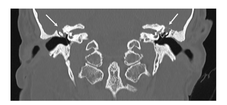
Fig. 1. Preoperative CT evaluation showing large tegmen defect associated with meningoencephalic herniation at the level of both mastoids (indicated with white arrows).