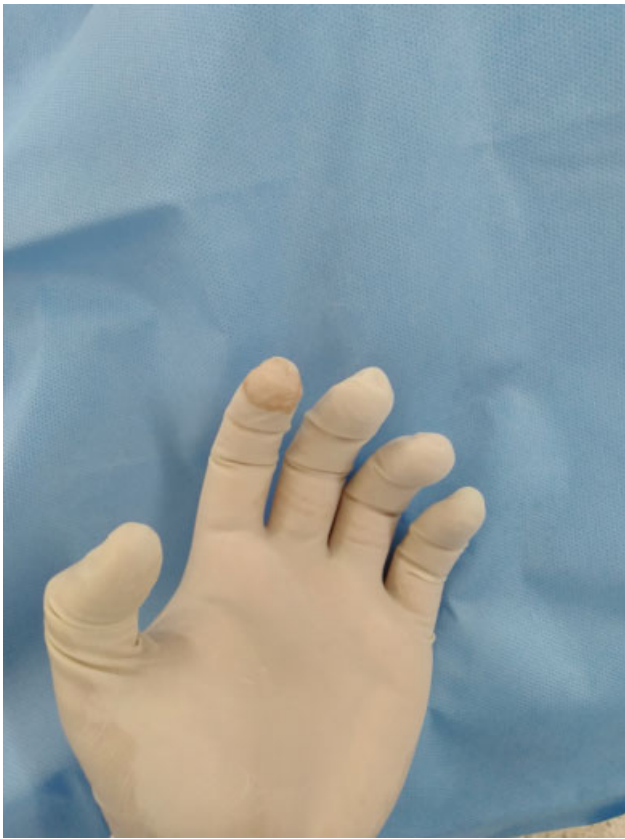
Fig. 1 Internal glove showing loss of integrity of the left index finger perceived at the end of surgery.

with indirect reduction), and open focus surgeries (direct reduction and manipulation of bone fragments, such as forearm or joint fractures)