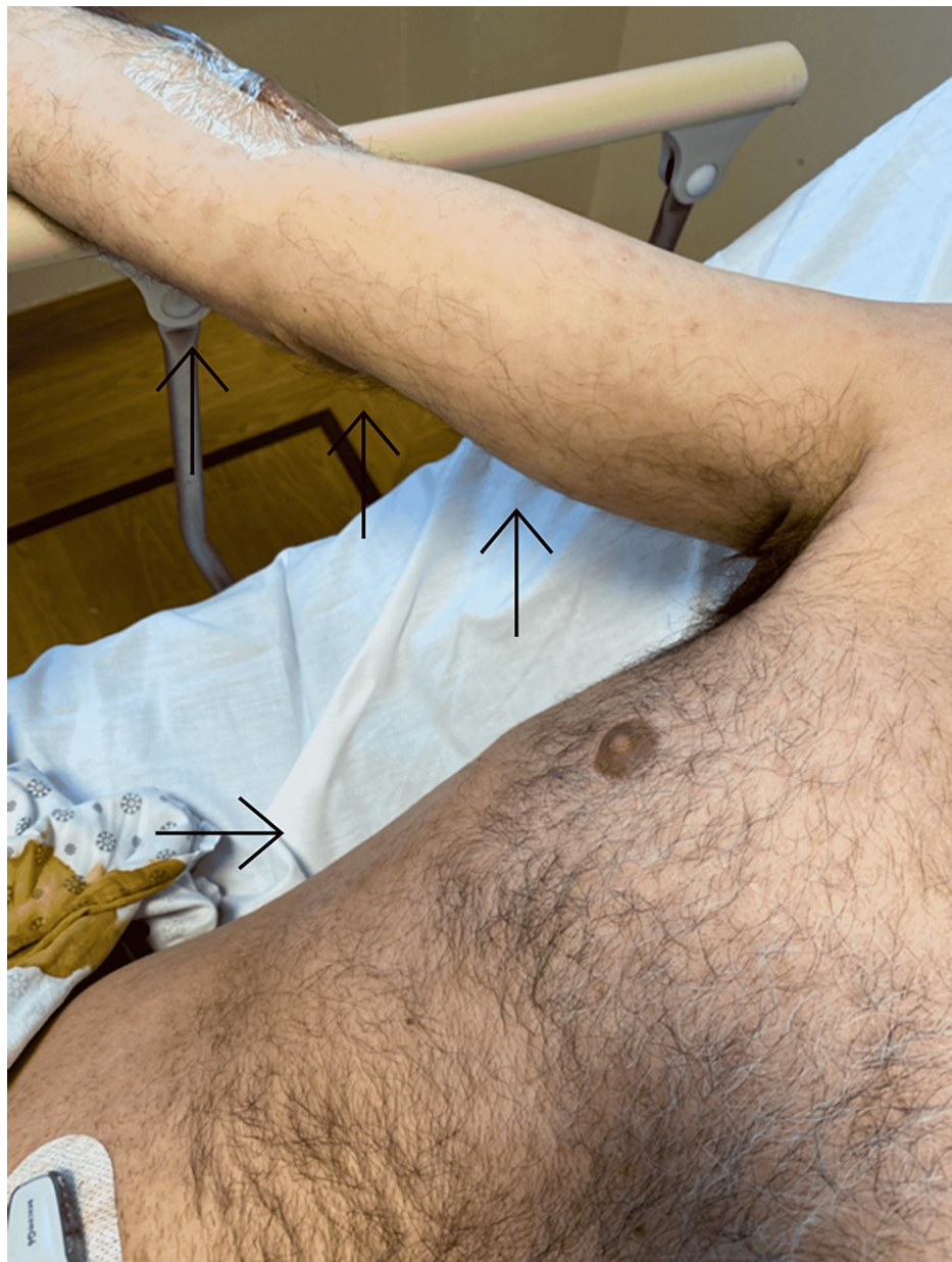
FIGURE 1: Maculopapular rash demonstrated on the right upper extremity and flank, designated by black arrows.

We present a 51-year-old male, with a past medical history of type 2 insulin-dependent diabetes mellitus (T2IDDM) without neuropathy, coronavirus disease 2019 (COVID-19) in April 2020 without residual symptoms, Raynaud's, and recent occupational outdoor exposure to insects as a construction manager who came to the emergency room complaining of a three-week history of bilateral progressive numbness and weakness beginning in his lower extremities and ascending toward his pelvis. He also reported the recent appearance of a maculopapular rash on his upper extremities and flanks (Figure 1). The patient is monogamous with his wife and does not use barrier protection. The patient denied any extramarital contacts. Sexual history from his wife was unavailable. He denied any previous history of syphilis or treatment for syphilis. Additionally, he denied any recent personality changes or ocular complaints.