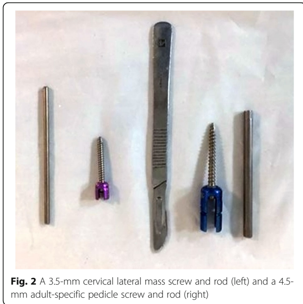
Fig. 2 A 3.5-mm cervical lateral mass screw and rod (left) and a 4.5-mm adult-specific pedicle screw and rod (right)

either in the early or late post-operative period, were identified and recorded.