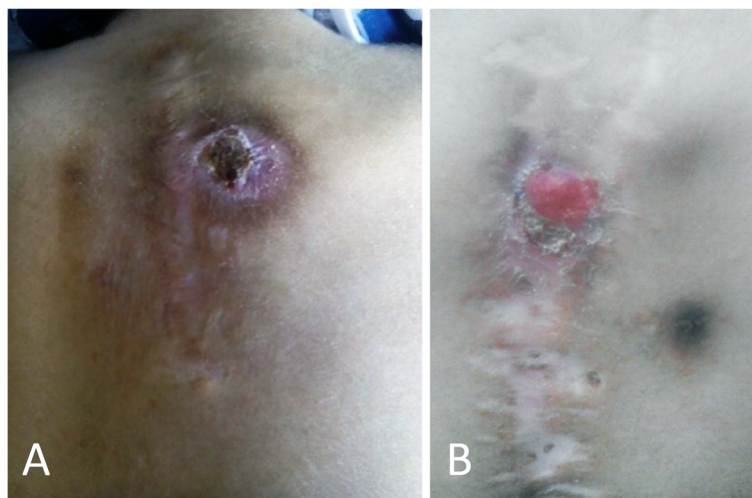
Fig. 1 A 25-month-old boy (a) and 30-month-old girl (b) with scoliosis, operated by adult-specific pedicle screws. Note hardware prominence leading to skin breakdown. Revision surgery was done for both patients

Demographic data were collected, and radiographic measurements were performed on pre-operative, immediate post-operative, and follow-up standing full spine posteroanterior and lateral radiographs. The main curve, compensatory cranial curve, and compensatory caudal curve were identified and measured by the senior author. To assess sagittal plane correction, segmental kyphosis or lordosis was compared with Bernhardt and Bridwell's corresponding standard values and was reported as positive for kyphosis and negative for lordosis [6]. Intra-operative blood loss, operative time, and complications were extracted from the operative notes. Complications,