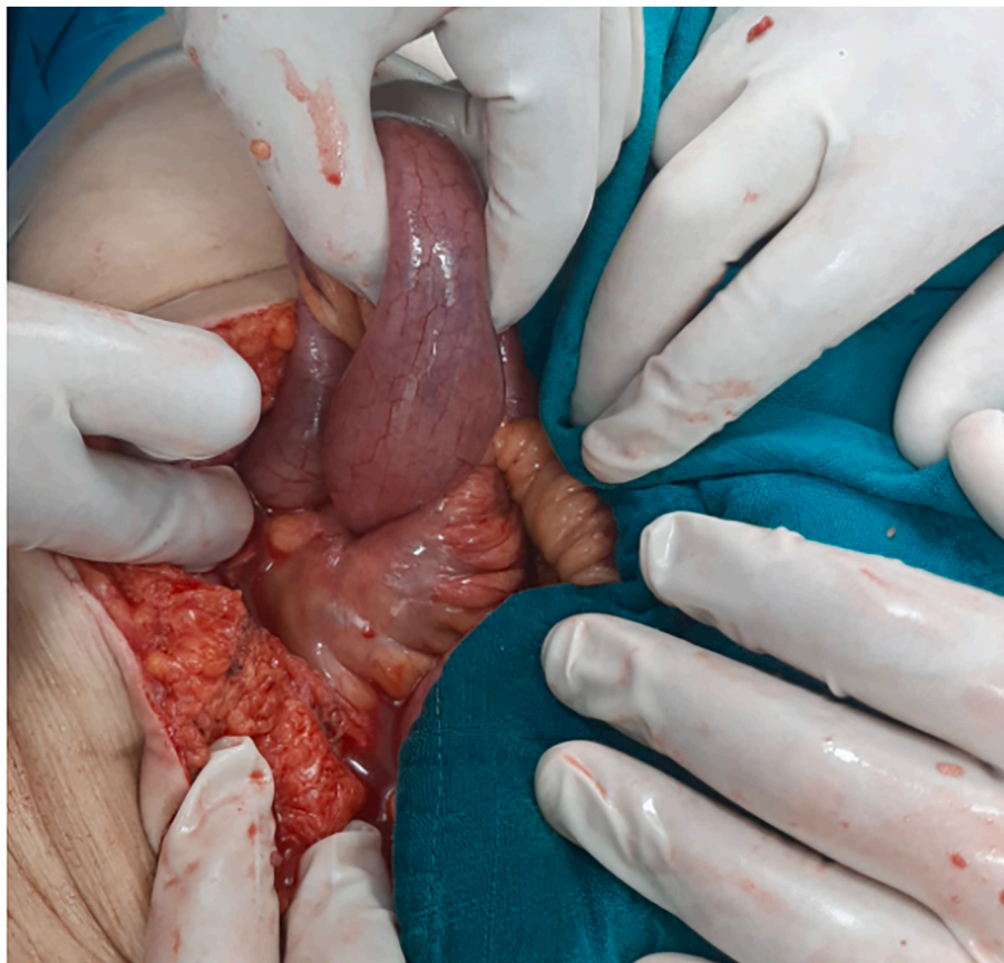
Fig. 2. Operative image showing the jejunojunal intussusception.

Not commissioned, externally peer-reviewed.