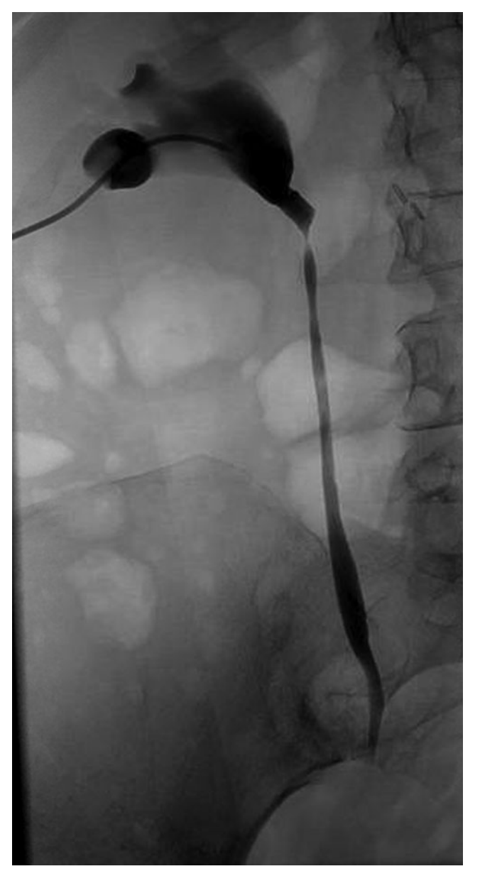
FIG. 3. Antegrade nephrostogram immediately after filter retrieval showing luminal narrowing at site of limb penetration, without evidence of extravasation.

made of a cobalt chromium alloy with platinum tungsten alloy radiopaque markers, are rated MRI conditional by the manufacturer, allowing for usage of MRI up to 3.0 Tesla. Interestingly, these filters have been noted to have an especially high rate of penetration, which increases with length of dwell time. Filter penetration can often be asymptomatic and alone is not considered an indication for filter retrieval, but complications can arise when surrounding organs are affected. Most commonly impacted is the duodenum, and involvement of the urinary tract is rare. Different management strategies have been used, and in some instances open surgical intervention has been indicated. In this case, the filter was effectively removed through an endovascular approach. No contrast extravasation was seen on postremoval inferior venocavogram. In one series, at this time published in abstract form only, extravasation occurred after 3% of complex