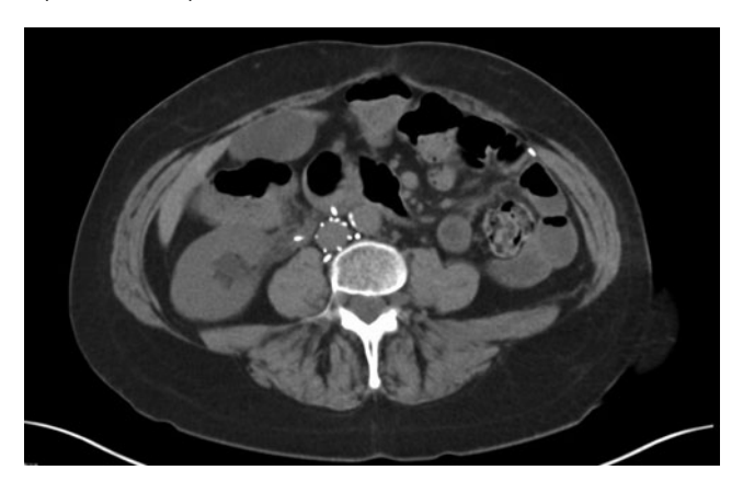
FIG. 1. Axial cut CT showing erosion of multiple IVC filter limbs, including limb projecting into lumen of right ureter with proximal hydroureteronephrosis.

embedded in the caval wall, which allowed it to be snared easily with a filter retrieval device. After this, the entire filter was withdrawn back into a sheath and removed. Concomitantly, percutaneous access for antegrade nephrostogram was performed (Fig. 3), which revealed some narrowing at the site of penetration but no contrast extravasation. A nephroureteral stent was effectively placed. Postprocedure course was uneventful and the patient was discharged home.