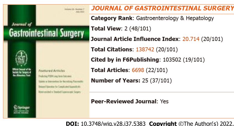
Figure 20 2022 Journal Article Influence Index and rankings of Journal of Gastrointestinal Surgery .