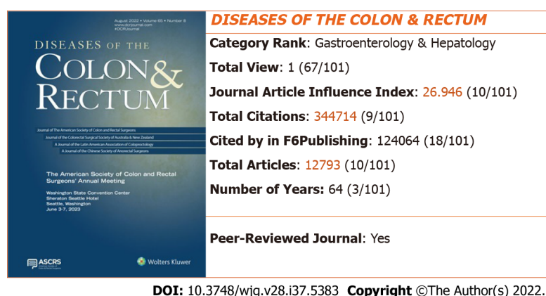
Figure 10 2022 Journal Article Influence Index and rankings of Diseases of the Colon & Rectum . The image of the journal cover is originally from the home page of the journal: https://journals.lww.com/dcrjournal/pages/default.aspx .