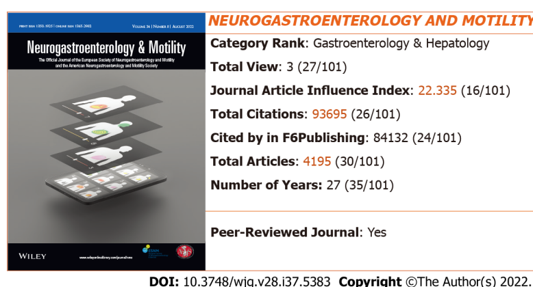
Figure 16 2022 Journal Article Influence Index and rankings of Neurogastroenterology and Motility.