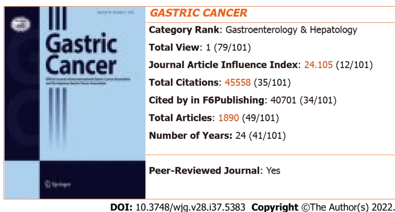
Figure 12 2022 Journal Article Influence Index and rankings of Gastric Cancer . The image of the journal cover is originally from the home page of the journal: https://link.springer.com/journal/10120 .