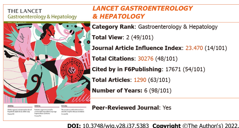
Figure 14 2022 Journal Article Influence Index and rankings of Lancet Gastroenterology & Hepatology . The image of the journal cover is originally from the home page of the journal: https://www.thelancet.com/journals/langas/home .