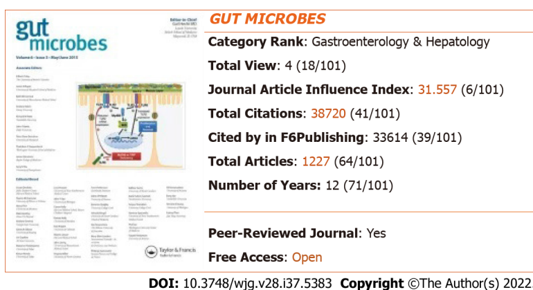
Figure 6 2022 Journal Article Influence Index and rankings of Gut Microbes. The image of the journal cover is originally from the home page of the journal: http://www.tandfonline.com/kgmi .