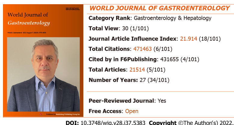
Figure 18 2022 Journal Article Influence Index and rankings of World Journal of Gastroenterology . The image of the journal cover is originally from the home page of the journal: http://www.wjgnet.com/1007-9327/index.htm .