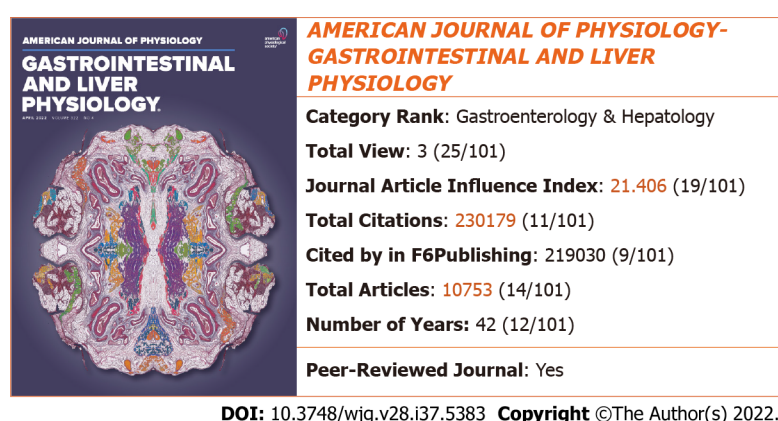
Figure 19 2022 Journal Article Influence Index and rankings of American Journal of Physiology-Gastrointestinal and Liver Physiology . The image of the journal cover is originally from the home page of the journal: https://journals.physiology.org/journal/ajpgi .