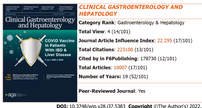
Figure 17 2022 Journal Article Influence Index and rankings of Clinical Gastroenterology and Hepatology. The image of the journal cover is originally from the home page of the journal: http://www.sciencedirect.com/science/journal/15423565 .

which allows academic evaluation of journals, scholars, institutions, drugs, medical devices, and publishers based on the JAI of each article in the citation analysis database, thus greatly enriching the academic evaluation systems across different disciplines and guiding the healthy development of the academic community[2].