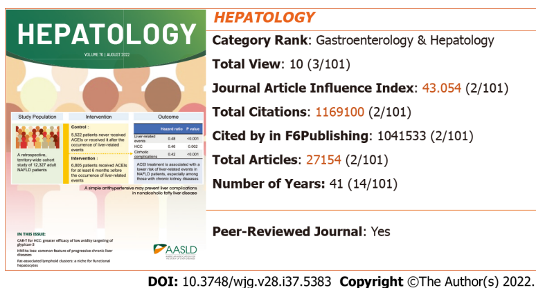
Figure 2 2022 Journal Article Influence Index and rankings of Hepatology . The image of the journal cover is originally from the home page of the journal: https://aasldpubs.onlinelibrary.wiley.com/journal/15273350 .