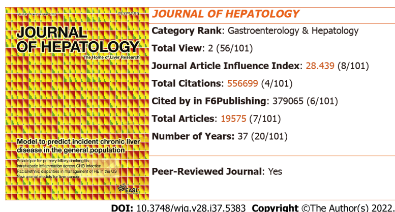
Figure 8 2022 Journal Article Influence Index and rankings of Journal of Hepatology . The image of the journal cover is originally from the home page of the journal: https://www.sciencedirect.com/journal/journal-of-hepatology .