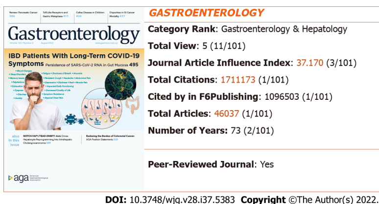
Figure 3 2022 Journal Article Influence Index and rankings of Gastroenterology . The image of the journal cover is originally from the home page of the journal: https://www.gastrojournal.org/ .

visit: https://www.referencecitationanalysis.com/SearchJournal .