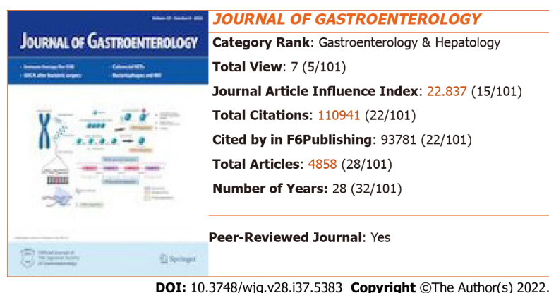
Figure 15 2022 Journal Article Influence Index and rankings of Journal of Gastroenterology. The image of the journal cover is originally from the home page of the journal: https://link.springer.com/journal/535 .