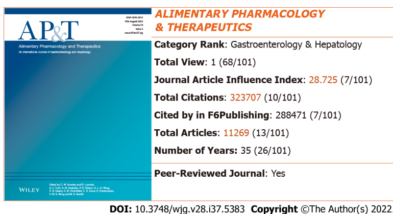
Figure 7 2022 Journal Article Influence Index and rankings of Alimentary Pharmacology & Therapeutics. The image of the journal cover is originally from the home page of the journal: https://onlinelibrary.wiley.com/journal/13652036 .