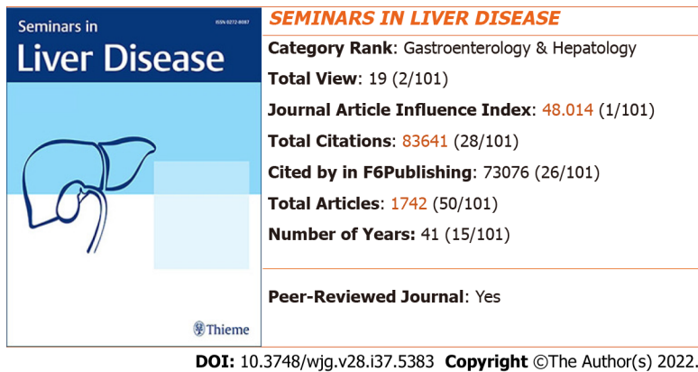
Figure 1 2022 Journal Article Influence Index and rankings of Seminars in Liver Disease .