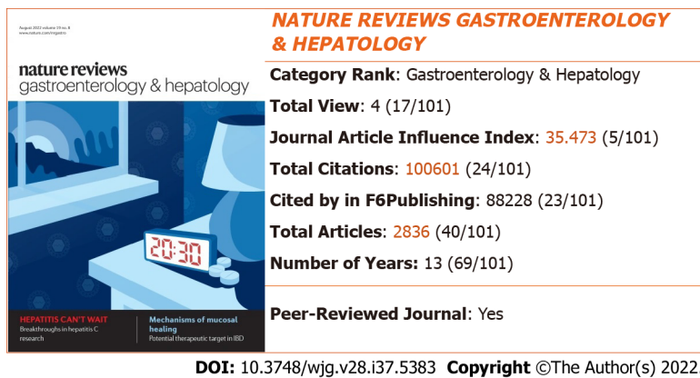
Figure 5 2022 Journal Article Influence Index and rankings of Nature Reviews Gastroenterology & Hepatology. The image of the journal cover is originally from the home page of the journal: https://www.nature.com/nrgastro/ .