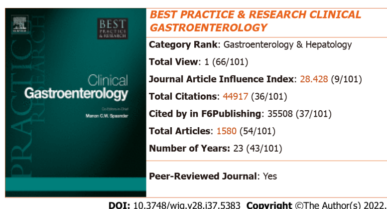
Figure 9 2022 Journal Article Influence Index and rankings of Best Practice & Research Clinical Gastroenterology . The image of the journal cover is originally from the home page of the journal: http://www.sciencedirect.com/science/journal/15216918 .