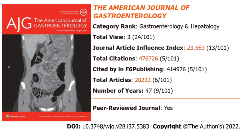
Figure 13 2022 Journal Article Influence Index and rankings of the American Journal of Gastroenterology . The image of the journal cover is originally from the home page of the journal: https://journals.lww.com/ajg/pages/default.aspx .