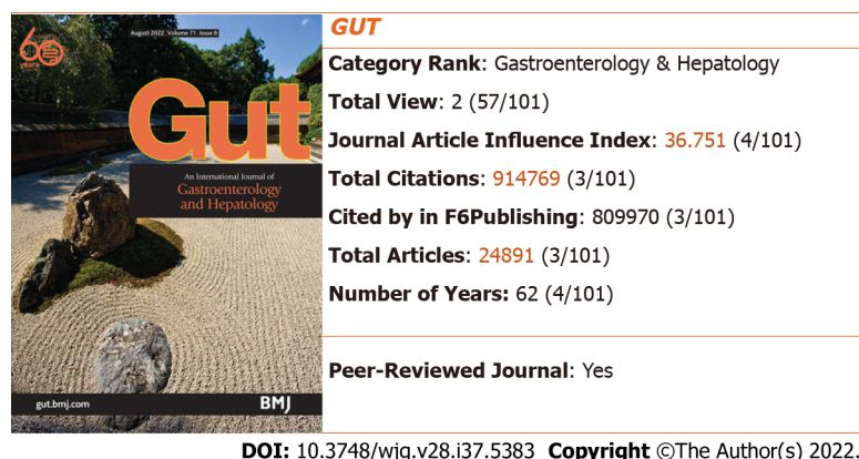
Figure 4 2022 Journal Article Influence Index and rankings of Gut . The image of the journal cover is originally from the home page of the journal: http://gut.bmj.com/ .