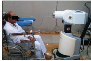
Figure 2: Patient with a catheter in airway during treatment on high-dose-rate-microselectron

three fractions once a week in the study done by Speiser and Spratling. [15]