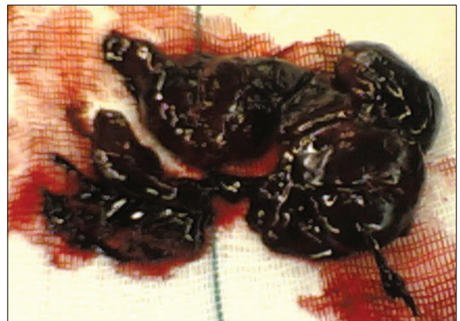
Figure 4. Hematoma mass after evacuation on a 10 × 10 cm sponge

inside the sternocleidomastoid muscle, appeared (Figures 3 and 4). The hematoma was evacuated and the bleeding site, the punctured right external carotid, was repaired by direct suturing. Subsequently, the sternocleidomastoid muscle was repaired, a hemovac drain was inserted, and the overlying skin was sutured.