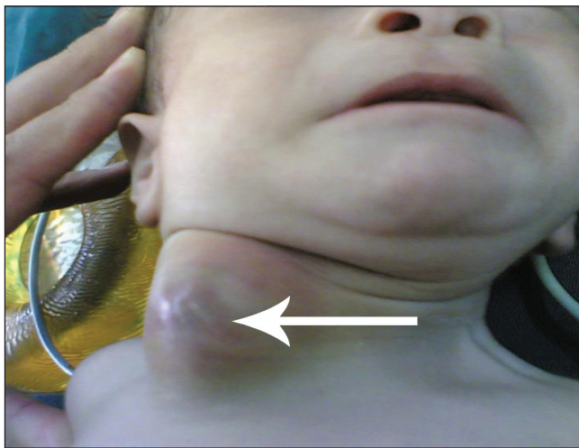
Figure 2. Anteroposterior view of the mass (arrow)

The patient was operated on in the supine position with a roll below the neck to extend the neck gently and produce a "thyroid position". The surgical approach was initially based on making the proximal and distal control of the right external carotid, but the hugeness of the cervical mass rendered it impossible. The skin over the mass was, therefore, gradually dissected and the mass, which was a hematoma around and