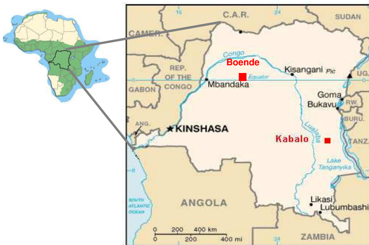
Figure 1 Location of study sites.

The first study was located in Boende, Equatorial province, in the northwest of the country and the second study in Kabalo, Katanga province, in the southeast of DRC (Figure 1). Malaria is endemic in DRC with perennial transmission in Boende and seasonal transmission in Kabalo, with a peak between November and May. The ethics committee of the NMCP of the Democratic Republic of Congo approved the two studies. The ethics review board of Médecins Sans Frontières also reviewed the study protocol for Kabalo. Written informed consent was obtained from children's carers before enrolment.