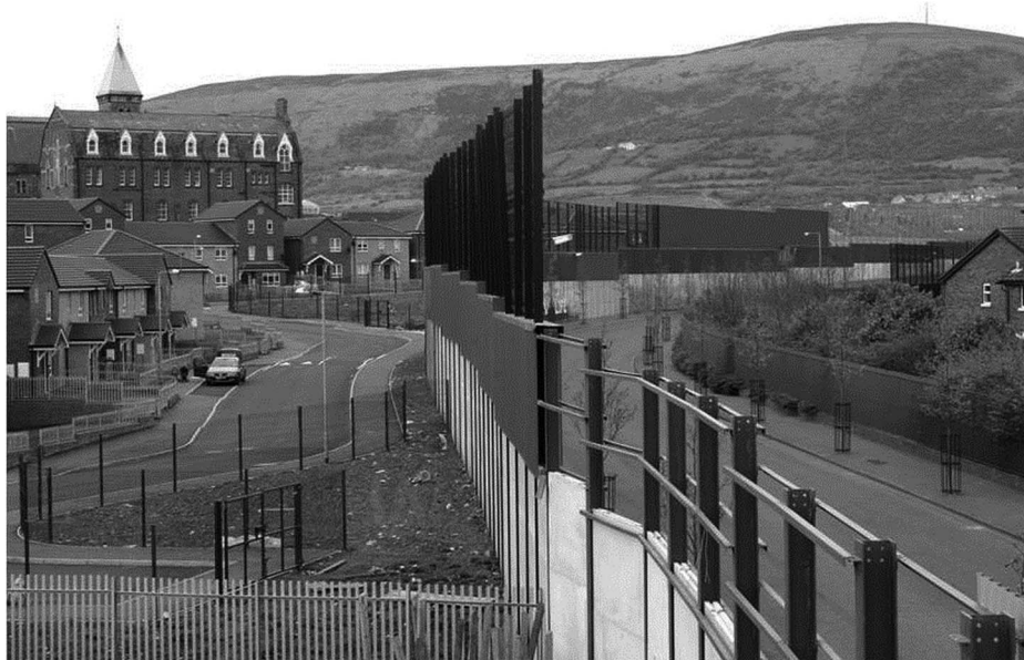
Figure 1 Segregation barrier in West Belfast.

the Middle East and the ‘wall effect’ or reactive depression caused by the Berlin Wall; 17 18 however, no empirical evidence exists regarding the impact these sociopolitical environments have on the health and well-being of the population. Segregated areas lack social cohesion and residential stability with a steeper population decline compared with the rest of Northern Ireland, 19 and have increased levels of violence, which are all deleterious to mental health. 20 Segregation barriers are erected with an aim to reduce conflict and violence and create a sense of protection.