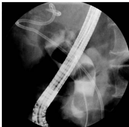
Fig. 1 Cholangiogram showing multiple large stones in the common bile duct of a 93-year-old man with no pre-existing illness, presenting with abdominal pain, fever, and jaundice of several days' duration.

reactivation of tuberculosis complicated by severe hospital-acquired pneumonia.