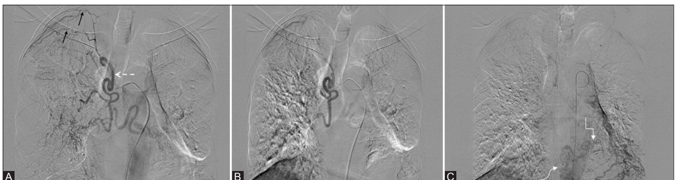
Figure 1 (A-C): (A) Selective angiogram of right intercostobronchial trunk reveals intercostal arteries (solid arrows – right second and third intercostal spaces) and a large common bronchial trunk (broken arrow). (B) Postembolization superselective angiogram of the common bronchial trunk revealed significant stasis of contrast material in the proximal lumen of bilateral bronchial arteries with no residual hypervascularity in bilateral lower zones. (C) Delayed phase in thoracic aortogram revealed a suspicious tortuous aberrant left inferior bronchial branch (square arrow) extending from infradiaphragmatic location (curved arrow) into mediastinum and then left lower zone

The origin of the bronchial arteries is variable, with approximately 70% arising from the descending aorta between T5 and T6 vertebrae. [2] The bronchial arteries that arise outside the level of T5 and T6 vertebrae but run along the course of major bronchi are termed anomalous/ectopic. The reported prevalence of anomalous bronchial arteries ranges from 8.3% to 35%. [3,4] These may originate from various systemic arteries including aorta. [3,5] In contrast, nonbronchial collateral (NBC) arteries enter the pulmonary parenchyma through adherent pleura or through the pulmonary ligament, and their course is not parallel to that of the bronchi. [1]