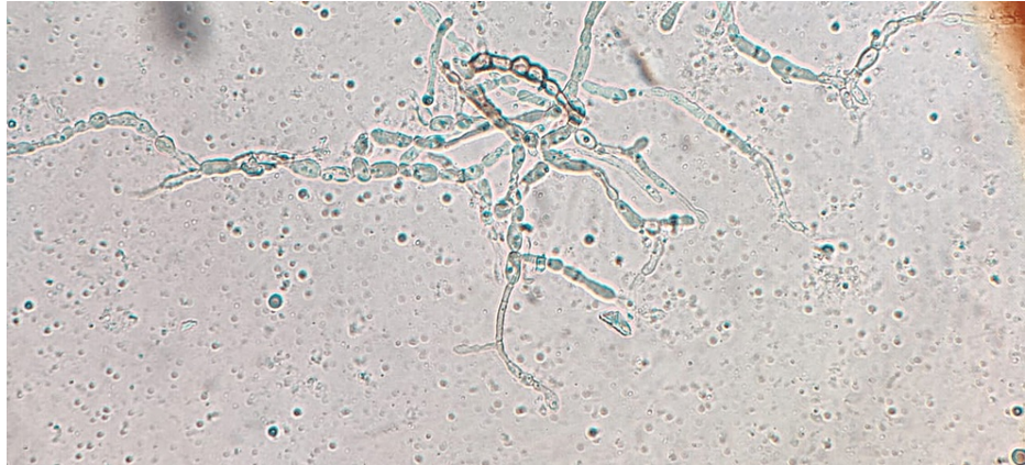
FIGURE 3: KOH mount of the aspirate showing the presence of irregularly swollen, septate, branched hyphae that were variably dark brown and hyaline spherical elements in short chains resembling chlamydo spores.

white stain 10% KOH preparation of aspirate, fungal elements were seen as fluorescent light blue-colored irregularly swollen branched hyphal structures. Fungal culture was inoculated on Sabouraud dextrose agar (SDA) slants, both with and without cycloheximide, and incubated at 25°C and 37°C. Growth was observed on the slants incubated at 25°C after one week as greenish velvety restricted colonies with a dark reverse that changed to black velvety growth in the next two weeks (Figure 4). Multiple lactophenol cotton blue (LPCB) preparations of the fungal growth at different incubation periods showed dematiaceous and hyaline branched hyphae with few septations without any conidiophores or conidia. Slide culture was inoculated but also yielded dematiaceous and hyaline sterile hyphae without any sporulating structures. The culture isolate was sent to the National Culture Collection of Pathogenic Fungi (NCCPF), Postgraduate Institute of Medical Education & Research (PGIMER), Chandigarh, for identification where it was identified as Aquastroma magniosiolata by DNA sequencing.