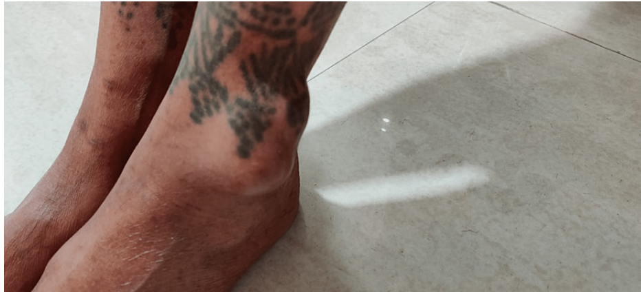
FIGURE 1: Nodular lesion on the lateral aspect of the lower leg.

There was no history of any pus or granular discharge, abscess formation, bony involvement, or fracture or similar lesions at any other body site. Any history of trauma at the affected part/limb could not be recalled by the patient. The patient was seronegative for human immunodeficiency virus 1 and 2 and hepatitis B surface antigen. Complete blood count, renal function test, and liver function test were within normal limits. There was no history of any chronic illness, diabetes mellitus, and steroid intake.