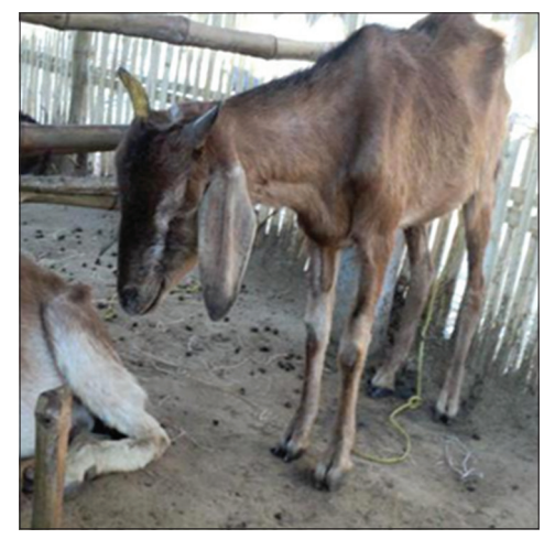
Figure-2: Respiratory distress in goats from the outbreak area.