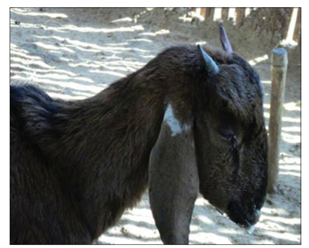
Figure-1: Lacrimation and mouth-frothing in goats from the outbreak area.

The flock of Vapi was comprised of both sheep and goat (n = 532, with 140 survivors only), whereas in Navsari, flocks contained goat only (n = 90, with 41 survivors). As a predisposing factor, transportation stress was associated with all the animals. The affected animals showed typical signs of PPR, including high fever, erosion in mouth, stomatitis, mucopurulent nasal discharge, sticky eyes, scab on mouth and lips, labored breathing, signs of pneumonia, and coughing as shown in Figures-1-3. At Vapi, it resembled to typical signs of PPR, but diarrhea had not a prominent sign in flocks of Navsari. As clinical signs were same in all the affected animals, only representative animals were sampled on a random basis.