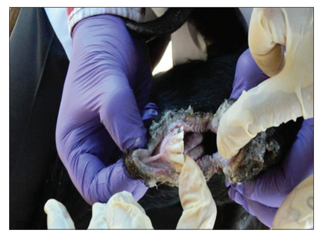
Figure-3: Mouth erosions in goats from the outbreak area.

Nasal swab (n = 25), mouth scab (n = 10) were collected in viral transportation medium (Earle balance salt solution with Kanamycin, pH 7.2) from live animals for antigen detection. Whereas, 25 serum samples were collected in vacutainers without anticoagulant (BD bioscience), for antibody demonstration, but one serum collection (sample no 8) leaked and