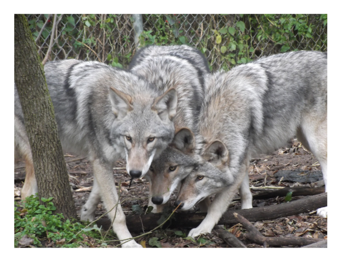
Figure 2. Three 6–7-month-old, littermate, F<sub>1</sub> hybrids between a male, western, gray wolf and a female, western coyote resulting from artificial insemination. doi:10.1371/journal.pone.0088861.g002