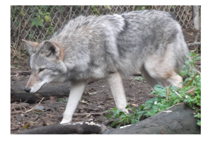
Figure 4. Side view of a 6–7-month-old F<sub>1</sub> hybrid between a male, western, gray wolf and a female, western coyote resulting from artificial insemination. doi:10.1371/journal.pone.0088861.g004