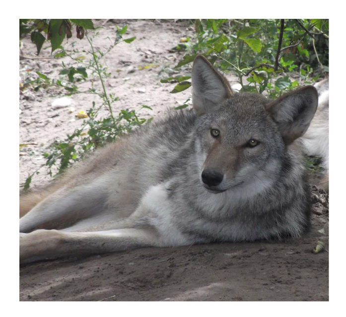
Figure 3. Facial view of two 6–7-month-old F_1 hybrids between a male, western, gray wolf and a female, western coyote resulting from artificial insemination. doi:10.1371/journal.pone.0088861.g003