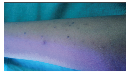
Figure 1: Multiple hyperpigmented follicular papules on flexural aspect of forearm

Eruptive vellus hair cyst (EVHC) represents developmental abnormality of vellus hair follicle. Cysts are characteristically located in the mid dermis and contain variable amount of laminated keratin and multiple transversally and obliquely cut vellus hair. We are reporting a case of EVHC in young female presenting as asymptomatic papules on flexor aspect of upper extremities.