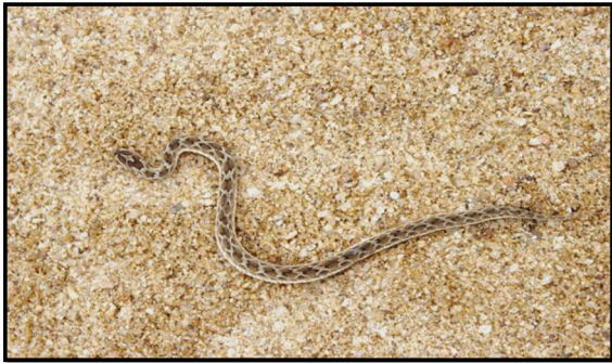
Figure 1 Example of a live saw- scaled viper.

antivenom serum (AVS) {Vins Bioproduct}, raised against Indian Daboia russelii , Echis carinatus , Naja naja and Bungarus caeruleus venoms, each vial was dissolved in 10 ml of sterile water and diluted with 200 ml of normal saline to a total volume of 300 ml and was infused intravenously over an hour to restore the coagulability. Despite of restoration of coagulability, the headache persisted throughout without any demonstrable neurological deficit.