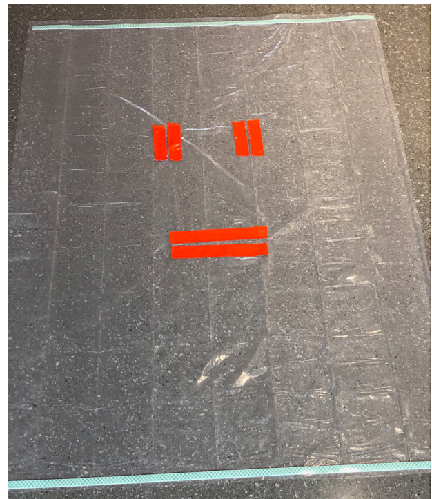
Figure 4. Plastic drape for cardiac arrest COVID-19 response. Used to cover patient during transport from ambulance bay to the resuscitation room. The drape has two vertical slits on top allowing the operator to access the airway and one horizontal slit below allowing for chest compressions or for further access as needed without having to remove the drape.

This bag includes a supraglottic airway device, bag valve mask, viral filter, end tidal carbon dioxide monitoring adapter, and a plastic drape used to cover patient.