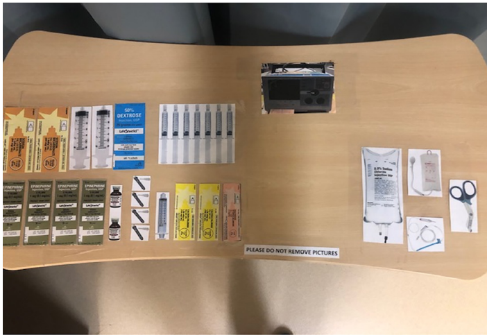
Figure 2. “Dump sheet” for cardiac arrest COVID-19 response. Medications most commonly used in cardiac arrest resuscitation and a defibrillator are pre-positioned by the code team on a sheet. Its purpose is to avoid contaminating the crash cart.