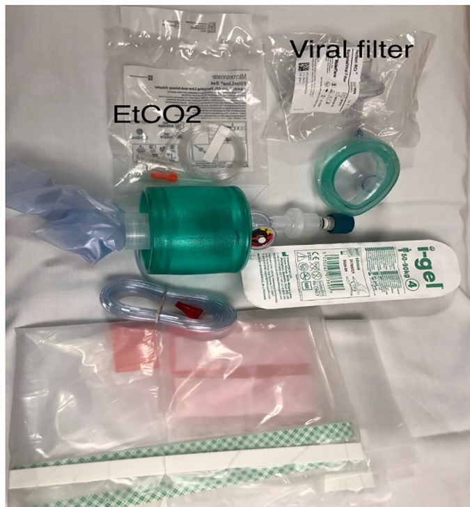
Figure 3. Cardiac arrest aerosol mitigation bag for cardiac arrest COVID-19 response.

This bag includes a supraglottic airway device, bag valve mask, viral filter, end tidal carbon dioxide monitoring adapter, and a plastic drape used to cover patient.