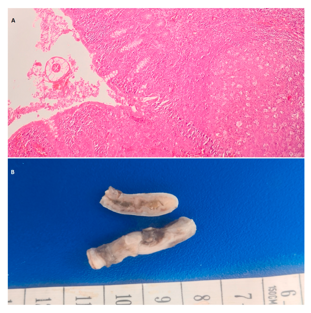
Fig. 3. A) A histopathology picture of a case of appendiceal section showing luminal E. vermicularis with lymphoid hyperplasia (H&E stained, 100x), B) A gross picture of non-inflammed appendix with E. v.