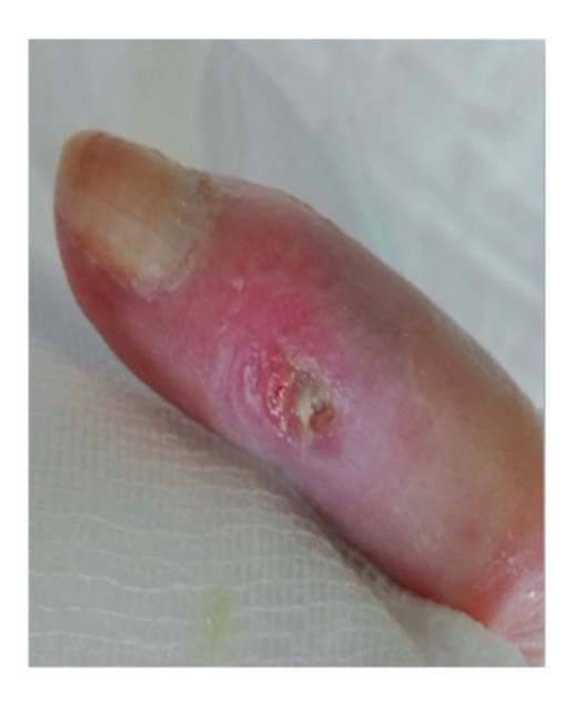
Figure 1b. Based on shape and consistency on palpation, calcinosis was classified as plate (palpable as large uniform agglomerate).

Each patient was also instructed to record the following data daily: pain level on a 0–10 severity scale (NRS: numeric rating scale), use of analgesics, adverse reactions to wound dressing, clinical features of perilesional skin (maceration, excoriation),