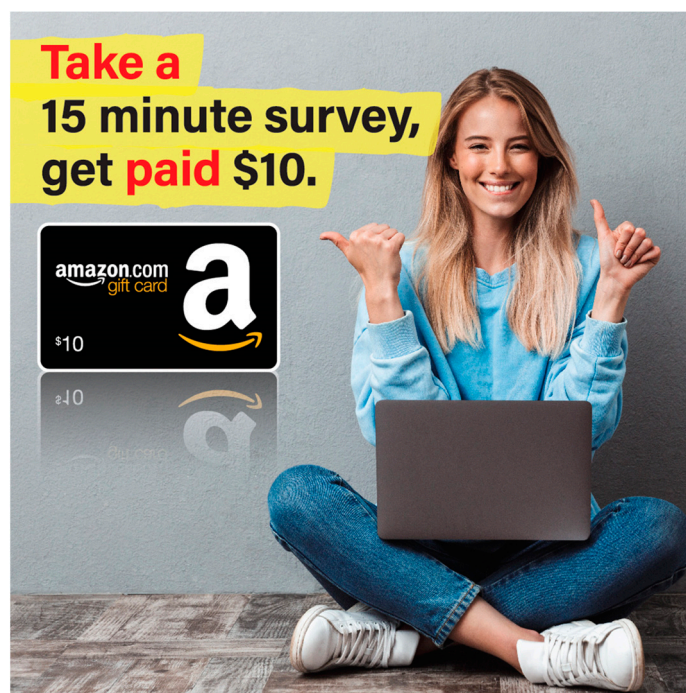
Figure 4. Facebook study recruitment ad.

The development of methods for experimentation within social media platforms is essential for the progress of public health media campaign research, especially in the context of tobacco control. This study demonstrated a new platform that allows for customized recruitment and longitudinal follow-up of participants, as well as the execution of survey research within Facebook, which was found to be feasible for media campaign awareness studies [14].