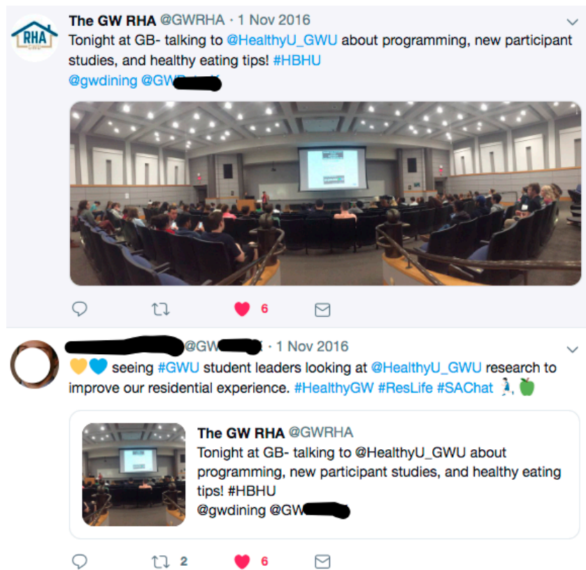
Figure 1. HBCU Facebook post 1.

There were different channels for recruitment using social marketing principles [30], such as placement of materials in high-trafficked areas and standardized branding using study-specific colors, logos, and fonts. Furthermore, technology was used as a specific outreach strategy. The following figures illustrate how these elements of the program were implemented. “Micro targeting” or delivering advertisements through Facebook targeting specific demographics, was used (see Figure 1). Key leaders on campus, such as academic deans, also tweeted or retweeted study-related recruitment efforts (see Figure 2).