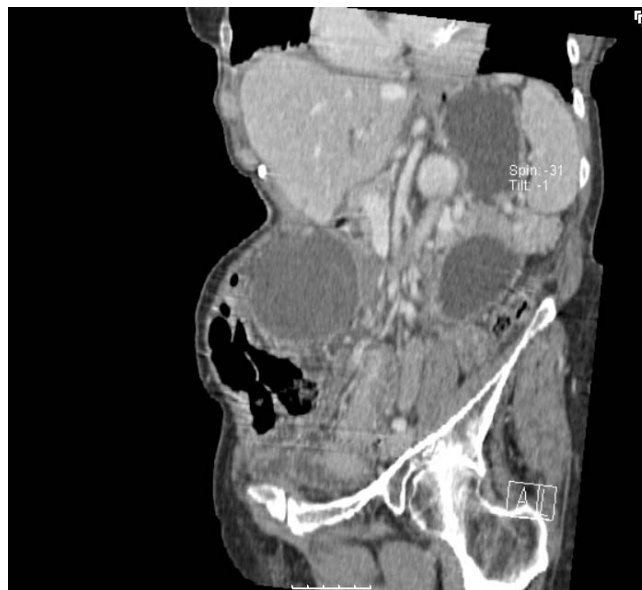
Figure 2 CT scan of the abdomen and pelvis in sagittal section.

in severity and the central abdominal mass was more tender. The decision was then taken to proceed to an emergency laparotomy.