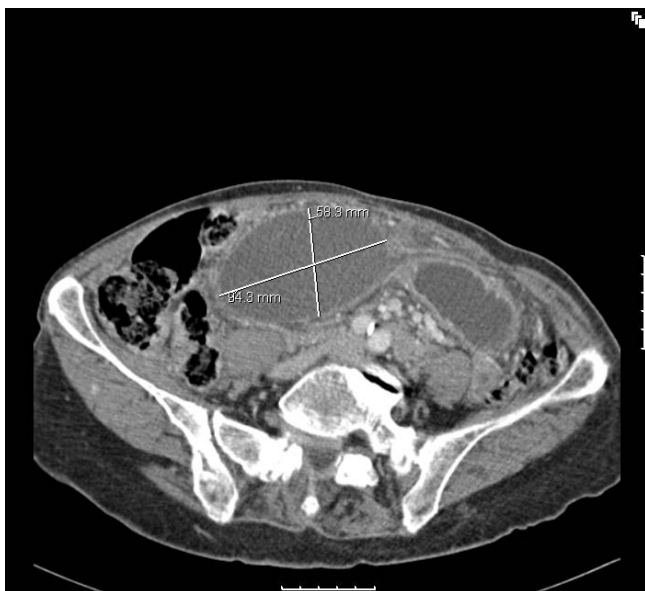
Figure 1 CT scan of the abdomen in horizontal section showing a cystic mass.

She was resuscitated with IV fluids and an emergency computerized tomography (CT) scan of the abdomen and pelvis was performed. This was reported as showing an oval cystic lesion in the central abdomen, with an AP diameter of 6 cm and a transverse diameter of 9 cm. This structure was unilocular with no connection to the bowel or mesentery but compressing the transverse colon (Figures 1 & 2). There were dilated small bowel loops in the pelvis. The liver, spleen, pancreas and both kidneys were normal. The decision to continue resuscitation and to further evaluate the patients for the nature of this mass was taken. However, by the next day, her pain had increased