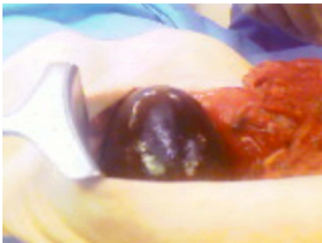
Figure 3 Intraoperative finding of gangrenous gallbladder.

two cases of acute gallbladder torsion in boys aged 4 and 5 years who presented with acute abdominal pain.