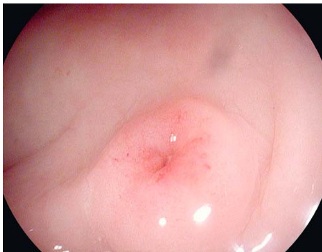
► Fig. 1 Colonoscopic examination revealed a nipple-like protuberance (about 5 mm diameter), which was concave at the top and accompanied by hyperemia.