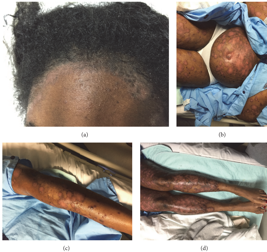
FIGURE 1: Psoriasis herpeticum. Erythematous scaly plaques with peripheral hyperpigmentation involving the (a) face, scalp, (b–d) torso, and extremities, with scattered ~1 cm erosions.