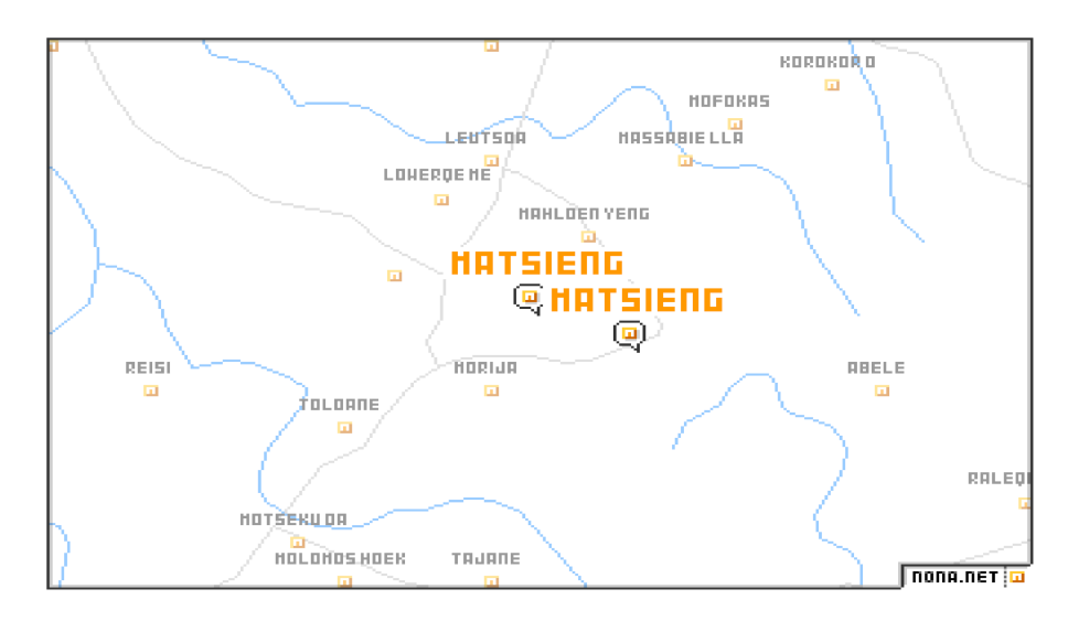
Figure 5. Map C shows Koro-koro, Mofokas, Leitsoa and Mahloenyeng.