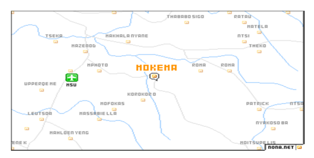
Figure 3. Map A shows Makhalanyane, Koro-koro, Mofoka, Leutsoa and Mahloenyeng.

The setting for this study is within the three constituencies (Matsieng, Koro-Koro and Rothe) that together form the rural communities of Maseru district. From Matsieng and Koro-Koro constituencies, seven rural communities will be drawn randomly to participate in this study. Six rural villages will be drawn from Rothe constituency because the researcher was not able to find statistics for other villages therefore, the total number of village/rural community participants will be twenty. A pilot study will be carried out at Ha-Teko that is also a rural village in Maseru. The maps below in Figures 3–5 show few of the rural areas that were selected for the study. A map that shows all areas under study was not found.