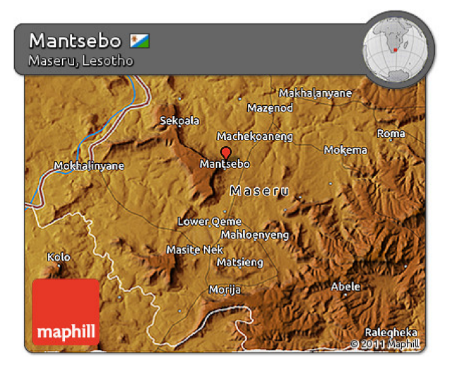
Figure 4. Map B shows Masite Nek, Mahloenyeng and Makhalanyane.