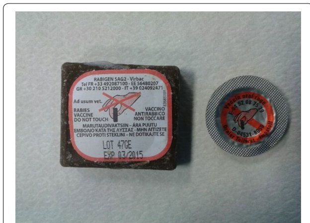
Fig. 1 The oral rabies vaccine bait and the PVC/aluminium sachet

During 2011–2014, the competent authorities received nine reports from dog owners or veterinarians about dogs exhibiting symptoms that were associated with the consumption of bait containing oral rabies vaccine during hunting. Reported cases occurred in the northern part of the vaccination area on the southeastern border (Fig. 2). Owners had either seen their dog eat a bait or there had