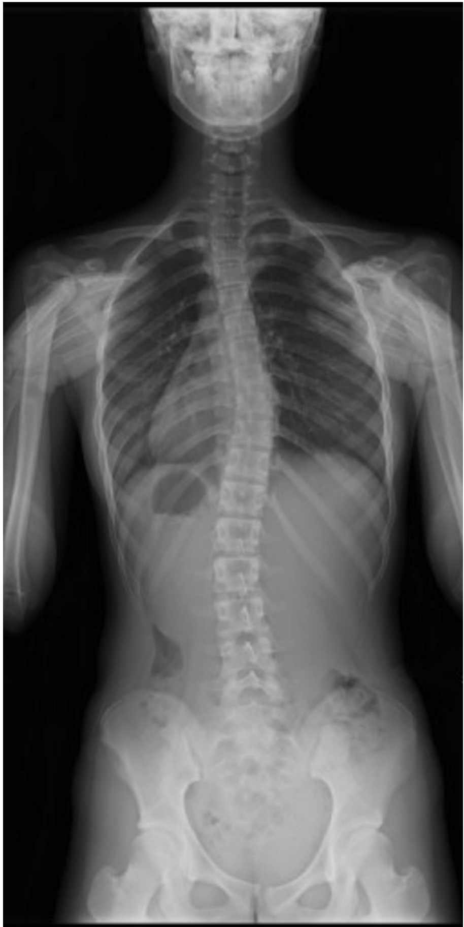
FIGURE 4: Standing posteroanterior radiograph (whole spine)