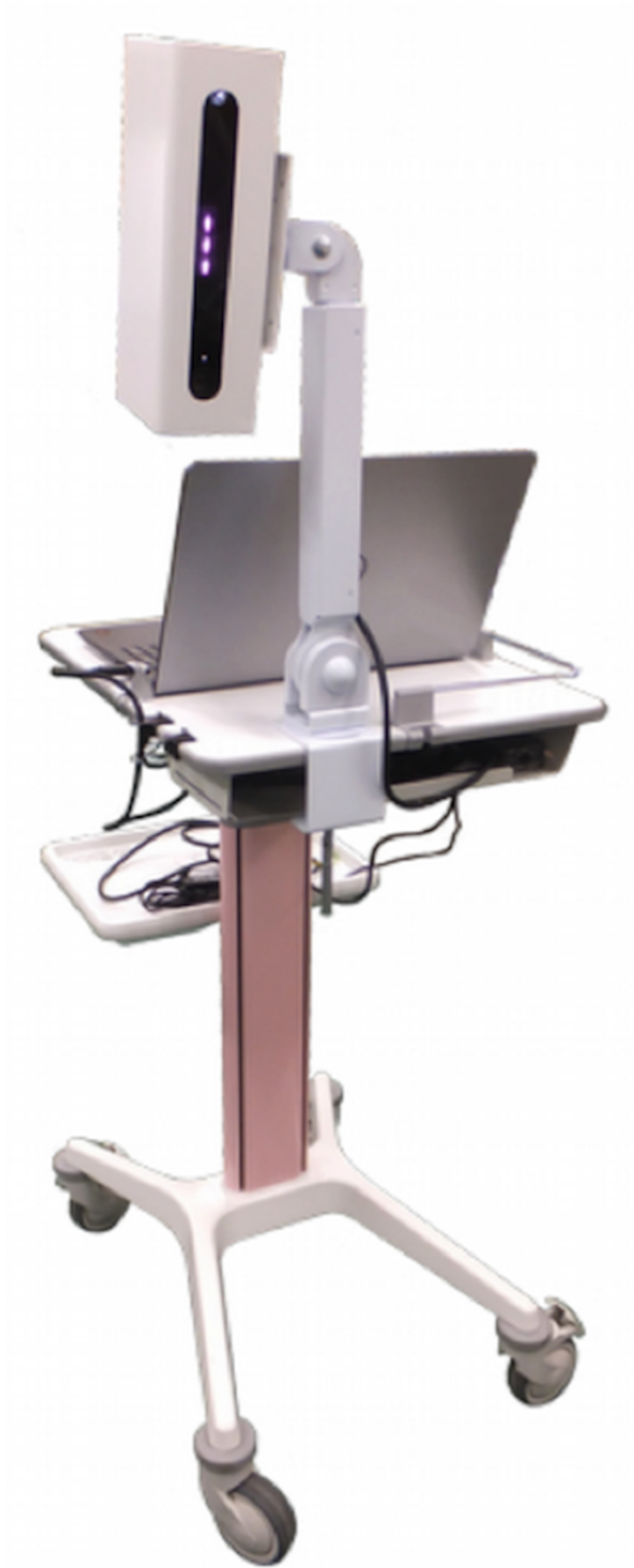
FIGURE 1: Hump measurement system with a built-in 3D