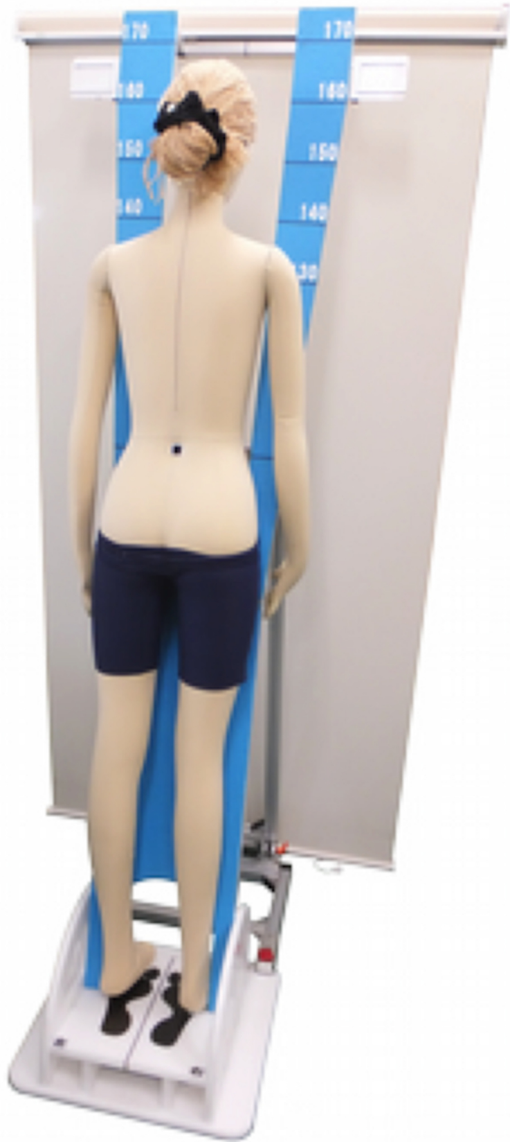
FIGURE 2: Stand for Digital Moiré imaging