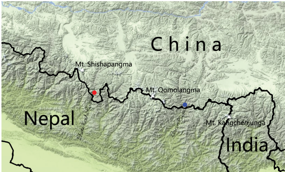
Figure 15. Distribution map of Laemostenus spp. L. zhentangensis sp. nov. (blue); L. zhamensis sp. nov. (red).

Venter. Propleuron, mesepisternum, and metepisternum smooth. Mesosternum not denticulate in front of mesocoxae. Metepisternum slightly longer than wide. All abdominal sternites with a few shallow wrinkles laterally, without ambulatory setae.