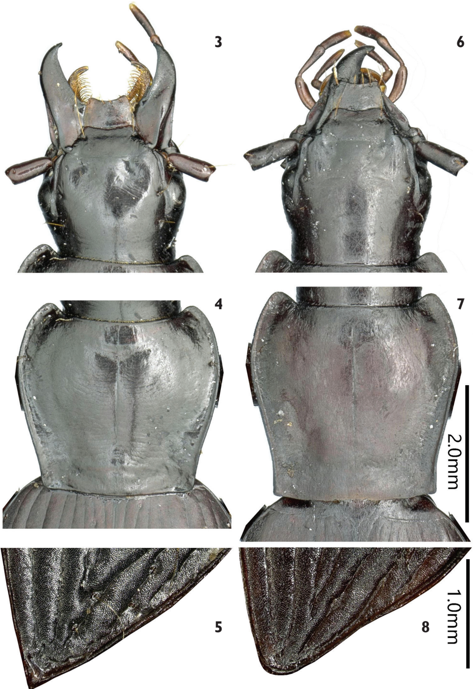
Figures 3–8. Morphological features of Laemostenus spp. 3–5 L. zbentangensis sp. nov. 6–8 L. zhamensis sp. nov. 3, 6 head 4, 7 pronotum 5, 8 sutural angle of elytron.