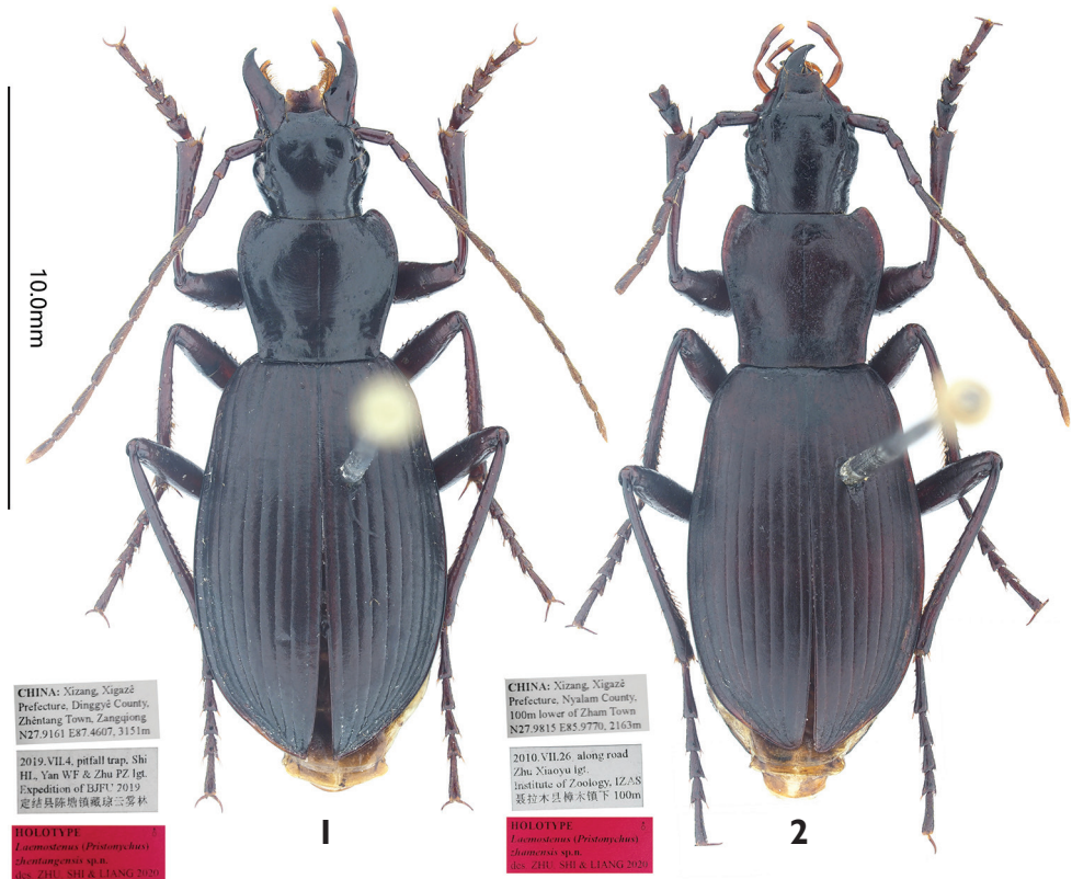
Figures 1, 2. Holotypes of Laemostenus spp. (general view and labels) 1 L. zhentangensis sp. nov. (male, Xizang, China, IZAS) 2 L. zhamensis sp. nov. (male, Xizang, China, IZAS).

Type material. Holotype: male (IZAS), body length 15.6 mm, pin mounted, with genitalia dissected and glued on cardboard pinned under the specimen; labeled: “CHINA: Xizang, Xigazê Prefecture, Dinggyê County, Zhêntang Town, Zangqiong, 27.9161°N 87.4607°E, 3151 m”; “2019.VII.4, pitfall trap, Shi HL, Yan WF & Zhu PZ lgt. Expedition of BJFU 2019. 定结县陈塘镇藏琼云雾林”; “HOLOTYPE ♂ Laemostenus (Pristonychus) zhentangensis sp. n. des. ZHU, SHI & LIANG 2020” [red label].