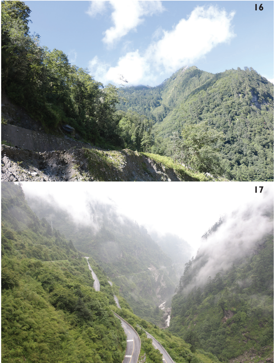
Figures 16, 17. Habitats in the type localities of Laemostenus spp. 16 Zangqiong, Zhêntang Town, Dinggyê County, Xigazê, Xizang, China; locality of L. zhentangensis sp. nov. 17 Nyalam County, 100 m below Zham Town, Xigazê, Xizang, China; locality of L. zhamensis sp. nov.

Distribution and habitat. This species is only known from Zham Town, Nyalam County, Xizang, China (Fig. 15). The only specimen was caught along road during day in a cloudy forest at 2163 m a.s.l. (Fig. 17).