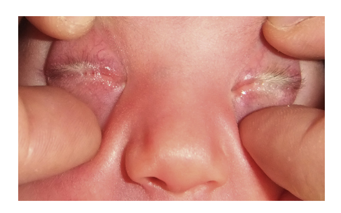
FIG 1. External photograph showing multiple bands connecting upper and lower lids bilaterally.

The surgery was performed under general anesthesia. Initially, a single band was cut with a scalpel blade to create a space. Afterward, one blade of blunt Wescott scissors was entered in the conjunctival space (Video 1, available at jaapos.org) with the tip pointed away from the globe to complete the opening. The ankyloblepharon