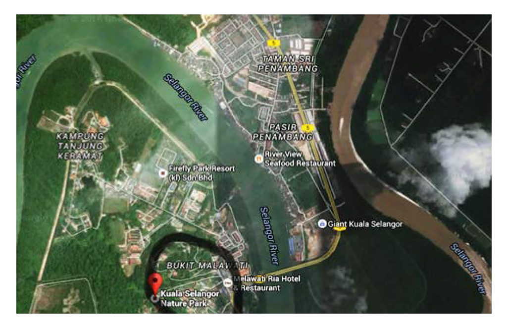
Figure 1: Map of study area (The black circle indicates samples of long-tailed macaque's hair that were taken).

National Parks (DWNP) helped to make the long-tailed macaques fainted. During anaesthesia, hair specimens were taken manually using latex gloves and surgical scissors, by clipping the hair as close as possible to the skin and extracting, as much as possible, hair strands from each macaque. Moreover, hair samples were cut from three different spots on each macaque's body. Then, each macaque's body weight, length and sex were recorded. Hair specimens were placed into sealed and labelled plastic bags and stored at the laboratory refrigerator until processed for analysis.