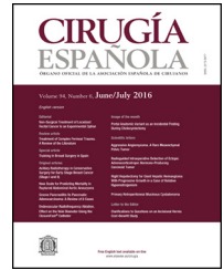
Image of the month