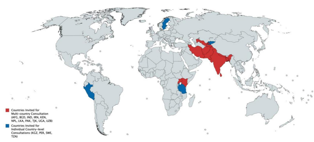
Figure 3 Participating countries in the sustainable development goals implementation consultations.

participated (figure 2). Chatham House Rule was explained and strictly followed to ensure frank exchanges and nonattribution of comments.<sup>9</sup> The final multicountry consultation was held in United Arab Emirates, where 11 additional countries were invited to participate: Afghanistan, Bangladesh, India, Iran, Kenya, Nepal, Pakistan, Sri Lanka, Tajikistan, Uganda and Uzbekistan (figure 3). Participants were required a priori to complete an assessment questionnaire based on the domains of the analytical framework.