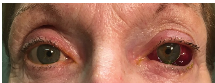
Image 1. Physical exam revealing a large, left-sided subconjunctival hemorrhage, proptosis, and chemosis. Patient consent was obtained to use this image.

Her neurologic exam revealed partial left cranial nerve III, IV, and VI palsies. Laboratory testing and computed tomography (CT) of the head were inconclusive. During the previous five months of visits, she had negative imaging including two CTs