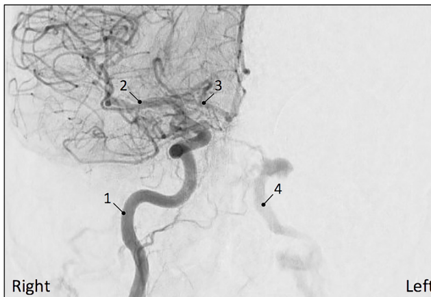
Image 2. Right carotid system angiogram revealing cross-filling into the left carotid system and left inferior petrosal sinus fistula. (1) Right internal carotid artery; (2) middle cerebral artery; (3) anterior cerebral artery; (4) left internal carotid artery.

discharge, her cranial nerve III and VI palsies resolved and cranial nerve IV palsy partially improved; however, her diplopia and blurry vision remained. These symptoms remained at the patient's one-year follow-up.