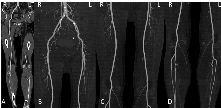
Figure 1. Lower extremity CTA using 120 kVp protocol in a 76-year-old man with PAD. A, curved planar reformatted image and B–D, maximum intensity projection images. The image quality was visually classified as score 4 (excellent) in the aortoiliac (B), femoropopliteal (C) and lower leg segments (D). doi:10.1371/journal.pone.0099112.g001

Moreover, lowering tube voltage and raising pitch are not only the strategies to reduce radiation dose but also the strategies to reduce contrast material requirements. Lowering tube voltage effectively increases attenuation of the iodinated contrast agent, which offers a potential of reducing the dose of iodine. It has been