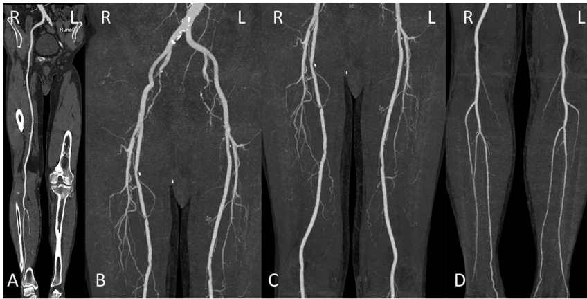
Figure 2. Lower extremity CTA using 70 kVp protocol in a 75-year-old man with PAD. A, curved planar reformatted image and B–D, maximum intensity projection images. The image quality was visually classified as score 4 (excellent) in the aortoiliac (B), femoropopliteal (C) and lower leg segments (D).