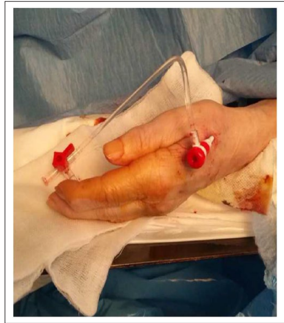
Figure 2. The 4F sheath placed in the distal radial artery at the site of the anatomical snuffbox.

An 84-year-old woman with a history of arterial hypertension, type II diabetes mellitus, atrial fibrillation and chronic heart failure recently underwent to percutaneous transluminal coronary angioplasty (PTCA) and valvuloplasty for which she was taking anticoagulation (Sintrom 4 mg) and double antiplatelet therapy (clopidogrel 75 mg + ASA 100 mg). Some days later, she presented melena and shock requiring blood transfusion and resuscitation maneuvers (hemoglobin (Hgb): 6.6 g/dL; platelet (PLT): 112 \times 10^3 \mu\text{L} ). Once she was hemodynamically stabilized, a gastroscopy was performed which showed normal findings and a colonoscopy which showed digested blood in the colon with many clots within ascending colon; hence, an urgent angiography and eventually embolization were requested.