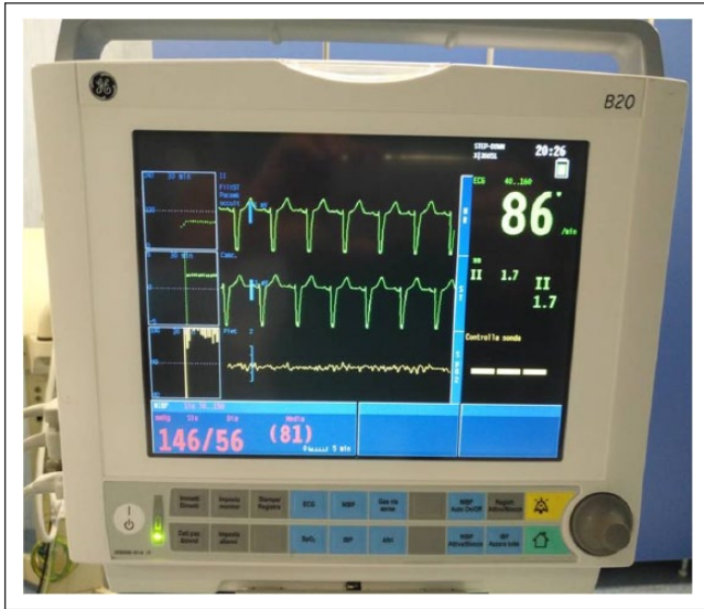
Figure 1. Barbeau test shows a D waveform recorded through the pulse oximeter. It demonstrates a loss of pulse tracing without recovery within 2 min (yellow line at the bottom).

Although TRA has many advantages, sometimes it can be difficult or impossible to reach not only in case of Barbeau D waveform but also for a small RA ( \leq 2 mm), anatomical variations (RA loops, tortuosity, hypoplasia) and in patients with a dialysis fistula. 2,5 For these reasons, it would be desirable to find another arterial access having the advantages of radial access when the latter is not feasible.