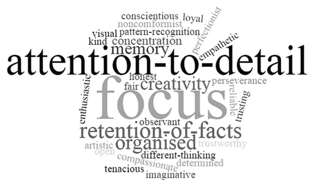
FIG. 1. Word cloud showing advantageous traits as described by participants.