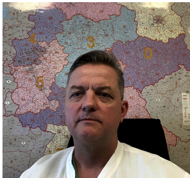
VIDEO 1. First author’s comment on the manuscript. Video available at: https://www.jtcvs.org/article/S2666-2507(21)00646-5/fulltext .

Redo thoracotomy for reoperative descending and thoracoabdominal aortic repair 11 is an example of this category. In this series of 60 patients, definite aortic surgical repair was delayed in 4 patients by 12 to 24 hours due to severe intraoperative bleeding. Patients recovered in the intensive care unit between surgical procedures and was associated with good outcomes in all 4 patients. It should be noted that all of the patients in which this approach were applied were elective cases.